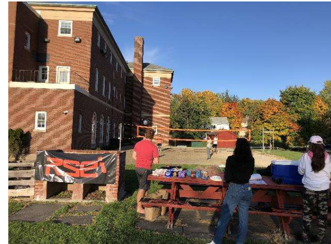
Volleyball Social on Oct 16th