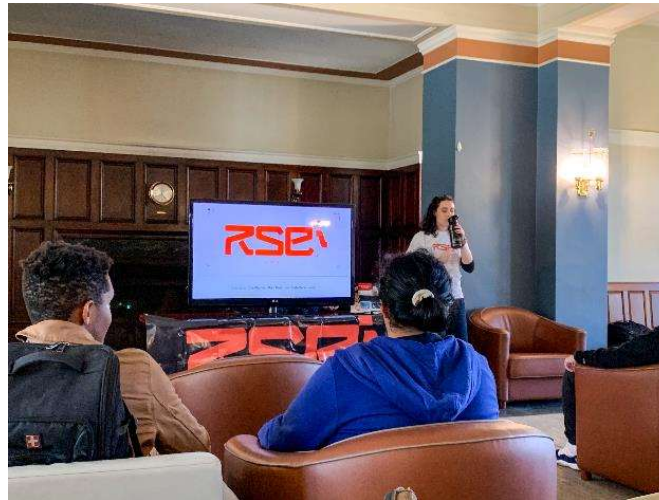
Campus Informational Session on Oct 1 st