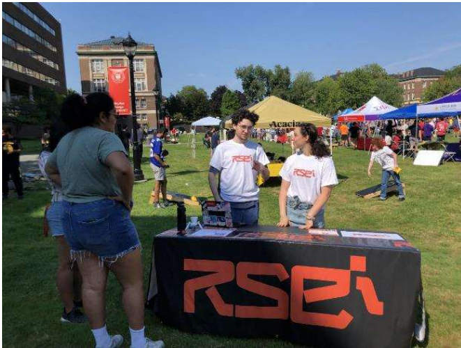
RPI Activities Fair & Fraternity/Sorority Round Up